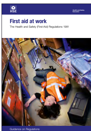
L74 (Third edition) Published 2013

This is a free-to-download, web-friendly version of L74 (Third edition, published 2013 – reissued with minor amendments in 2018). This version has been adapted for online use from HSE’s current printed version.